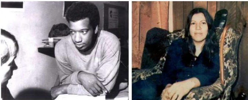
Fred Hampton of the Black Panther Party, and Anna Mae Aquash of AIM.

Therefore, we ask that groups and individuals read this document against the practice of badjacketing, discuss it, and consider publicly endorsing here that we will refrain from the practices of badjacketing. This is not a call to be lax about security; indeed, many of us have been very involved in the provision of security at the Fourth Precinct. Instead, it is a call to be democratic and accountable about our security practices. Please indicate your endorsement in the comments below.